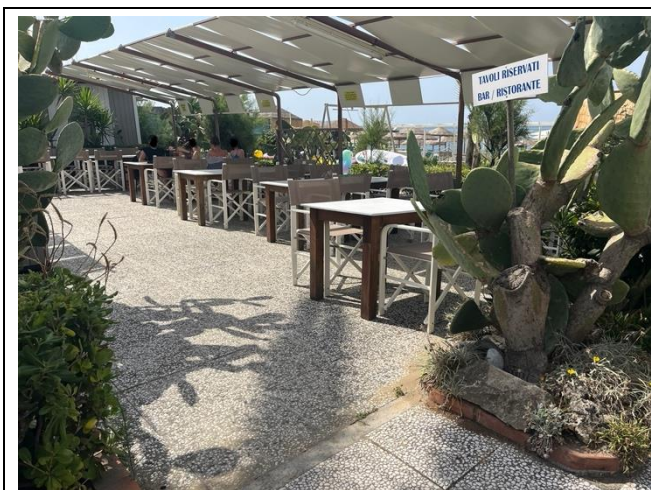
Restaurant bar tables